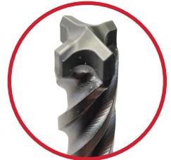
4-Cutter cutting edge technology