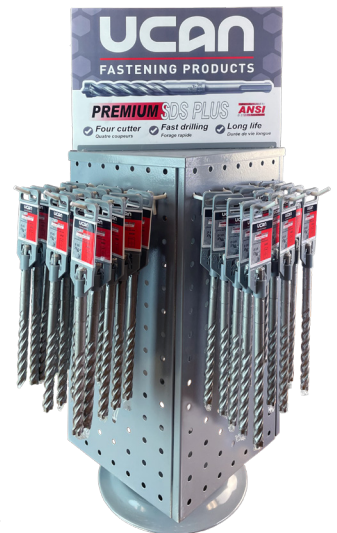
Countertop display available

Individually plastic wrapped & vacuum sealed